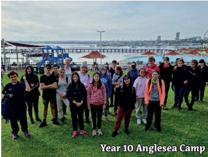
Year 10 Anglesea Camp

Website: www.heatherwood.vic.edu.au Email: heatherwood.sch@education.vic.gov.au