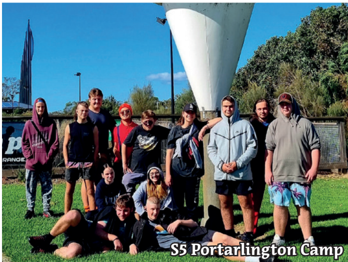
S5 Portarlington Camp