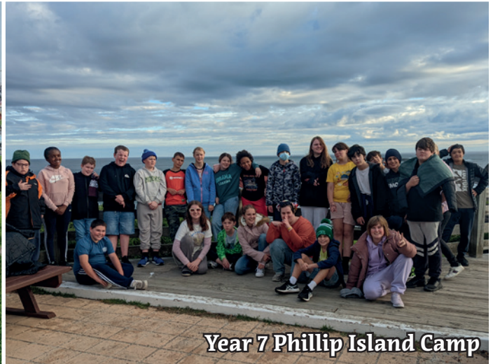
Year 7 Phillip Island Camp