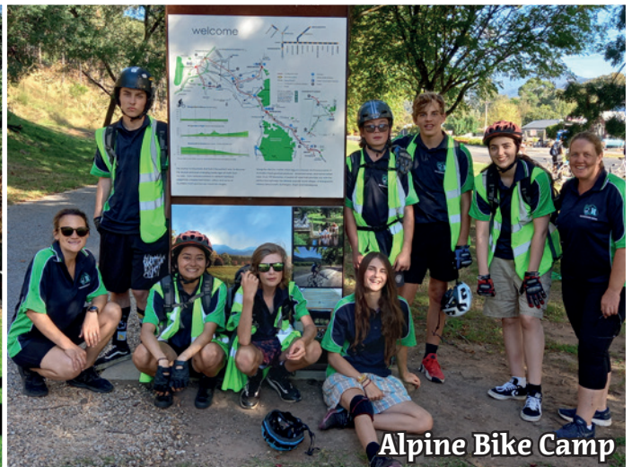
Alpine Bike Camp