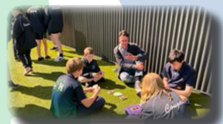
Celebration of friends playing Uno in the yard with a teacher.