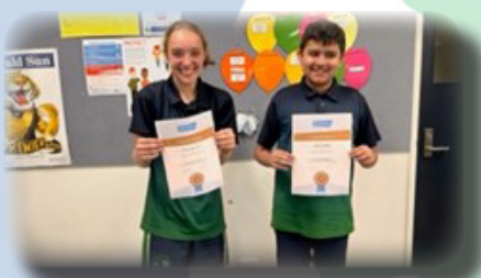
Celebration of Mathletics Awards at the Year 8 Assembly.

The following photos are a small example of students' achieving and the way we celebrate each student's success. Achievement, Success, Celebration is our aim for every student in the school.