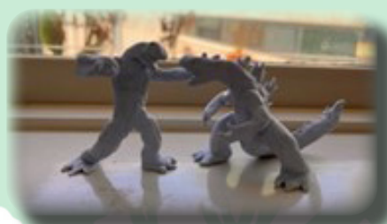
Celebration of a Year 7 student's sculpture.