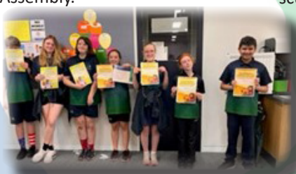
Celebration of Literacy achievements at the Junior Assembly.