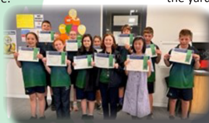
Celebration of Student of the Week for Personal Achievement.