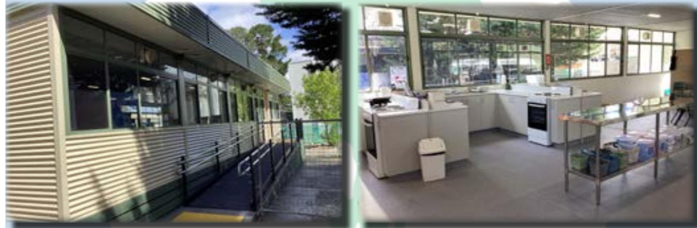
The new Food Technology portable.