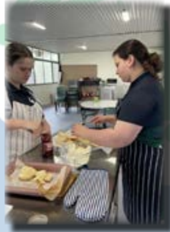
Madi and Skyee making yummy scones!