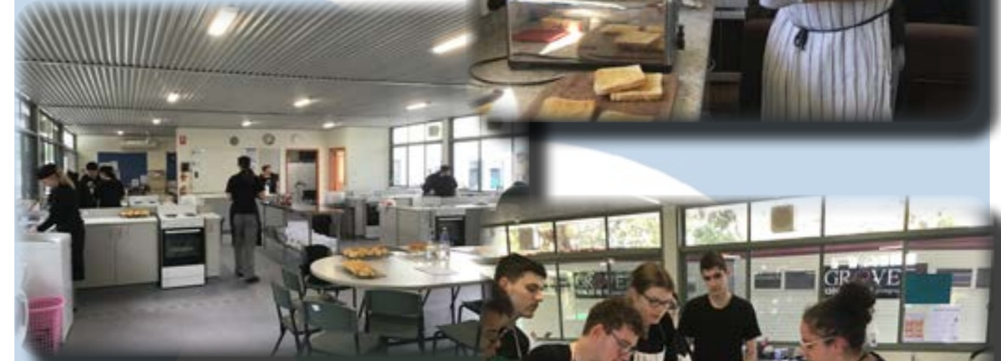
Above is the new Food Tech portable