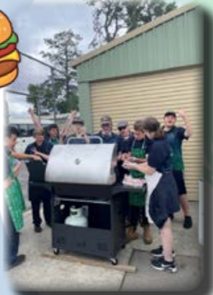
M5 christen the new BBQ!