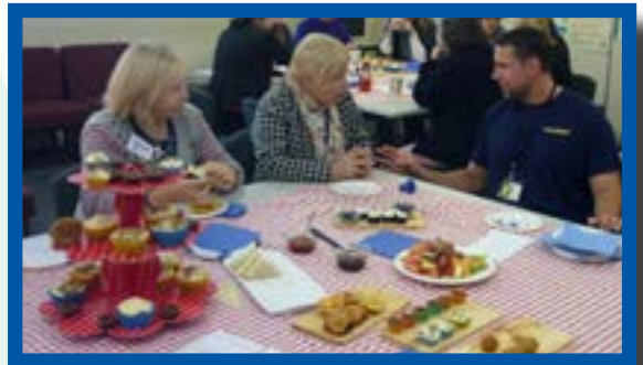
Staff enjoying the morning tea