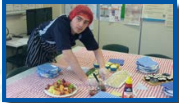
Setting up the staff room for the Biggest Morning Tea