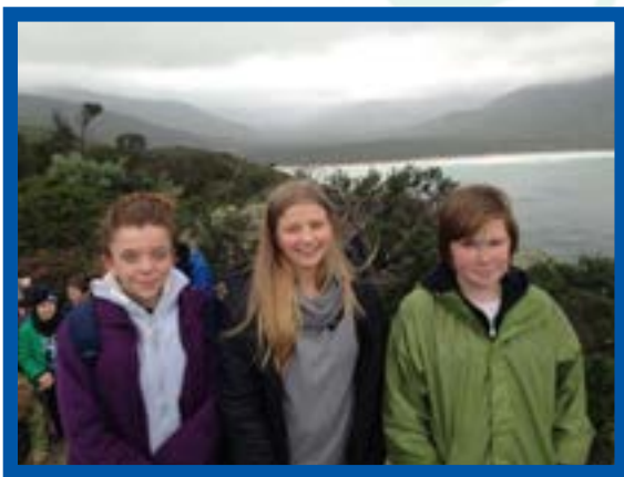
Year 7 students taking in the scenic views at Wilsons Prom and feeding the kangaroos at the wildlife park on Phillip Island.

The Year 8s are looking forward to their camp to Rubicon Outdoor Education Camp in November.